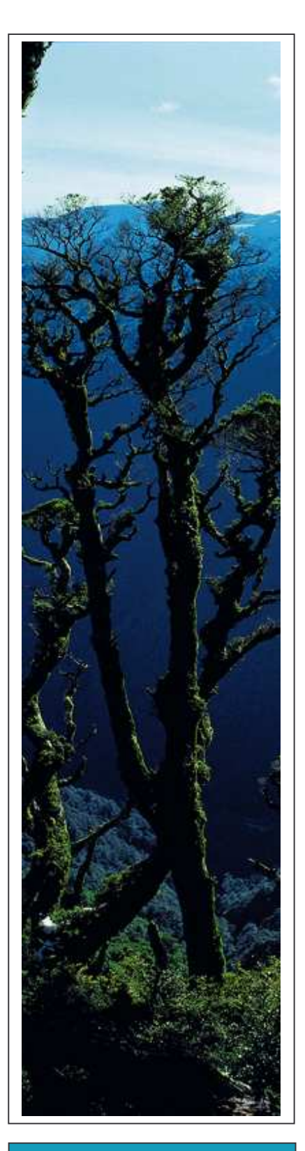
Tawhai – New Zealand Silver Beech

Part of this learning was to consider the effects of sickness upon our bodies and then translate these illnesses to Papatūānuku. It was soon apparent that she too was vulnerable to the whole range of health problems experienced by mankind. Among many other illnesses her veins became blocked as in the case of slips or debris gathering in rivers such as seen during the storms of February 2004 and her blood could be poisoned as when pollutants find their way into the waterways. The only time she has a good clean out is when it rains or during storms. If people wanted their mother to care for them then they had to minimise the risk of her becoming sick. Sometimes the elements (her children) combine to help their mother, in so doing they flush away the paru (dirt), processes that man has no control over and should perhaps be resigned to accepting as being a part of the earth.