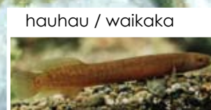
hauhau / waikaka