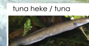
tuna heke / tuna