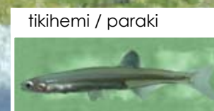
tikiheimi / paraki