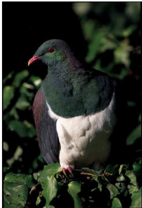
Kereru pictured right

One way to cook kererū was to encase the whole bird in clay and then place it in an open fire. When the clay cracked open the bird was ready. The feathers stuck to the inside of the clay while the intestine shrunk away. Kererū fat was used to as a preservative to store other food in.