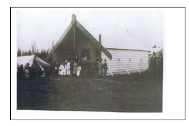
Image:Te Kapoho o Rangihirawea at the Mataikona River mouth was blown down in the circa 1948