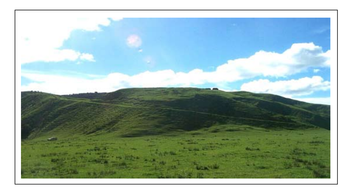
Image: Site of Ikapurua Pa - Mataikona – 2003. Terracing can be seen above the track going diagonally up the front of the hill. An idea of the size of the pa can be gathered by looking at the four wheel drive vehicle at middle left of the photo.

See Also: Masterton District Council District Plan Sec F4 p 240 Archaeological Sites Ref. NZAA N159/5