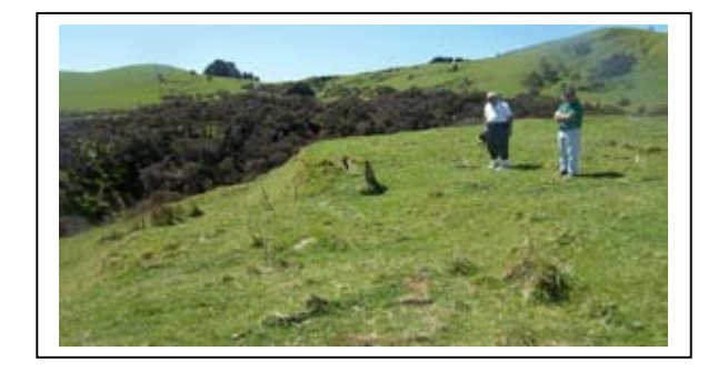
Image: Jim Rimene and Edward Beetham atop Rauatahanga Pa site near Wainuioru – 2003