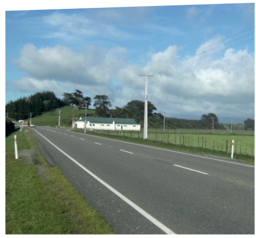
Hāmua in 2012, Te Poari used to sit on the hill behind the hall