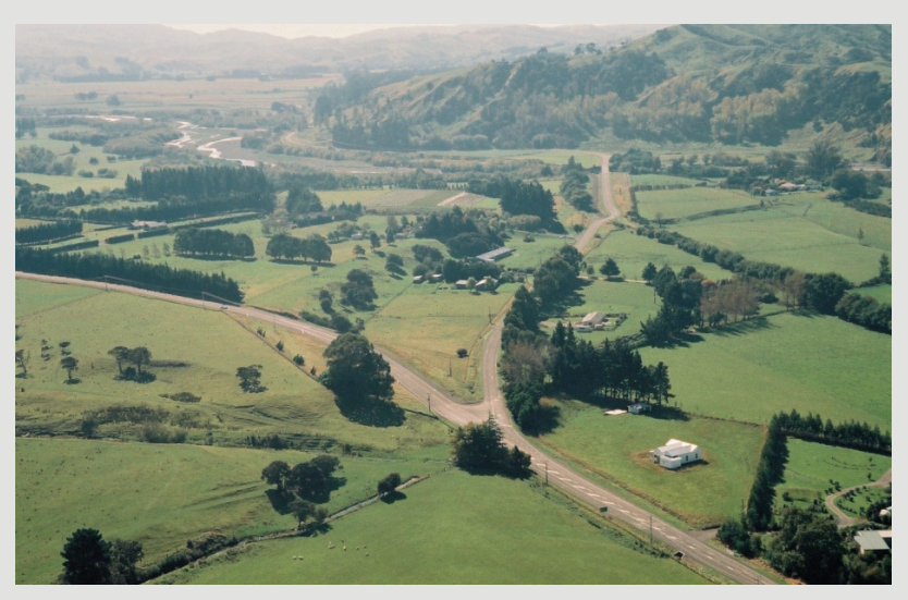
Mokonui at the intersection of State Highway 2 and Opaki Kaiparoro Road with Tirohanga maunga top right and the Kopuaranga Valley in the distance.

Mokonui is the rise on the corner of State Highway 2 and the Opaki – Kaiparoro Road (Mauriceville turnoff) intersection about 8 kilometres north of Masterton. The Opaki plains end at the bottom of the rise and the Whakauma plain begins at the top, it is here that Te Tapere Nui o Whatonga began. There was a papakainga called Mauku Rangi above the intersection and a 17th century one called Mokonui further south near Wingate Road.