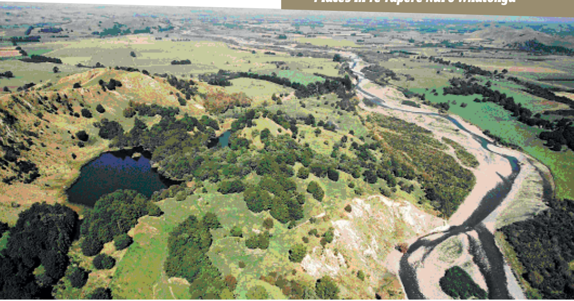
Hidden Lakes shown on the left with the Ruamahanga River to the right (looking south towards Masterton)