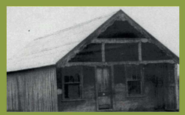
Tutaekara Pa archive photo

The meeting house at Tutaekara the once busy kainga was called Raupani which means blistered feet. The specific hapū of Tutaekara was called Ngāti Te Kapuarangi, another in the wider Ngāti Hāmua complex. Today the name Te Kapua o Te Rangi has been given to the Kohanga Reo at Pahiatua.