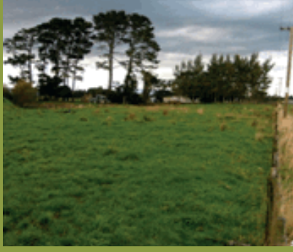
Site of Tutaekara 1km south of SH2 junction